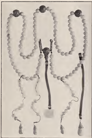
MANDARIN OFFICIAL NECKLACE IN GREEN JADE AND OTHER STONES